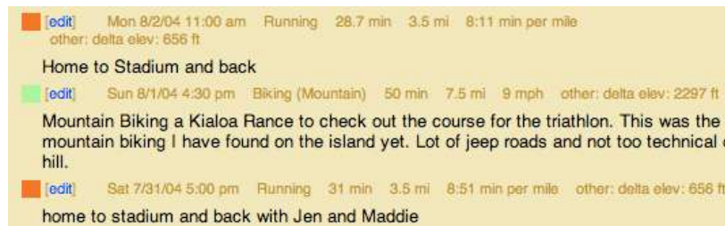
Sample view of log entries